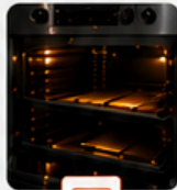
OVENS & OVEN RACKS