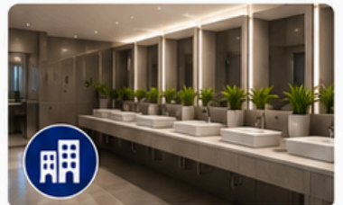
COMMERCIAL & PUBLIC TOILETS