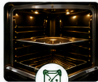
Ovens, Grills & Tandoors