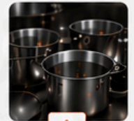
UTENSILS & KITCHEN EQUIPMENT