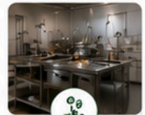
Stainless Steel Workstations