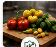
Food Preparation Areas