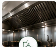
Chimneys & Exhaust Systems