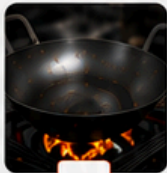
KADAI & TAWA