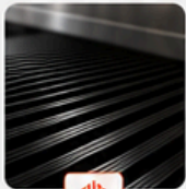
GRILLS & GRIDDLE PLATES