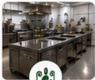
Kitchen Surfaces & Workstations