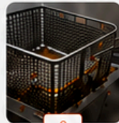
DEEP FRYERS & BASKETS