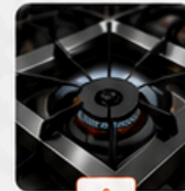
BURNER TOPS & COOKING RANGES