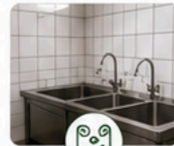
Kitchen Tiles & Walls