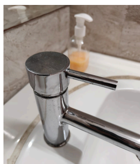
After use of P12

Pulfresh Bathroom Cleaner P12 effectively removes rust stains