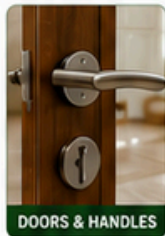
DOORS & HANDLES